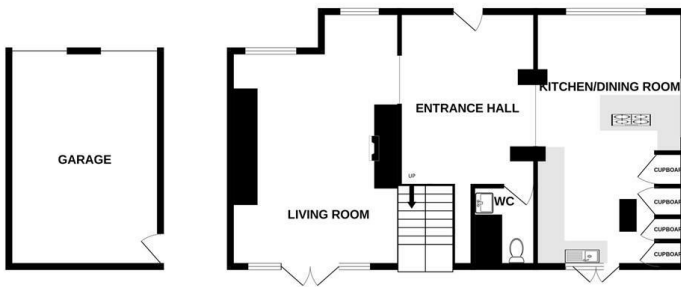
GROUND FLOOR 1002 sq.ft. (93.0 sq.m.) approx.